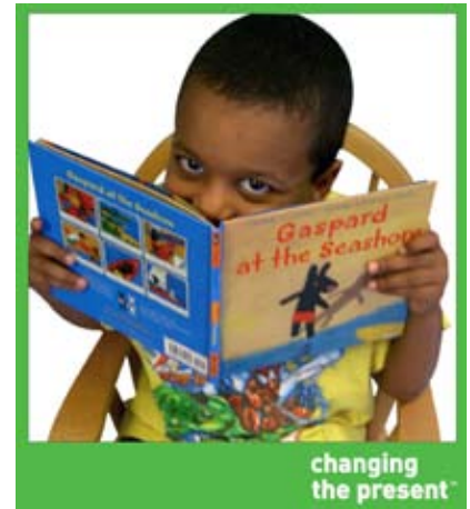
Nurture Imagination - First Book

Just imagine the impact we can make together as this new kind of giving catches on!