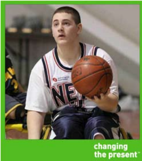
Encourage Athletes - United Spinal Association

A few of the donation gifts available at ChangingThePresent.org :