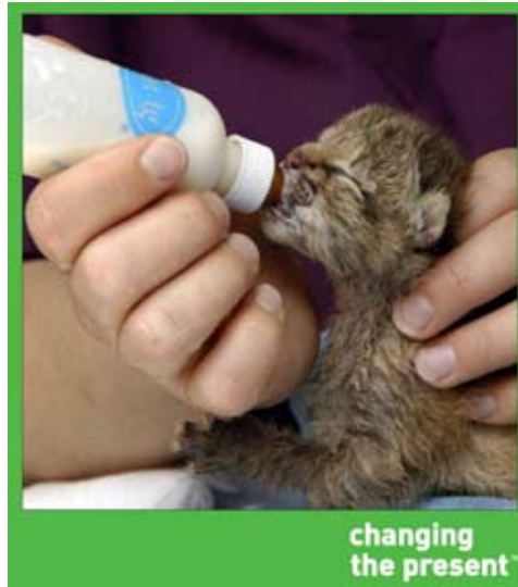
Raise an Orphan - Best Friends Animal Society