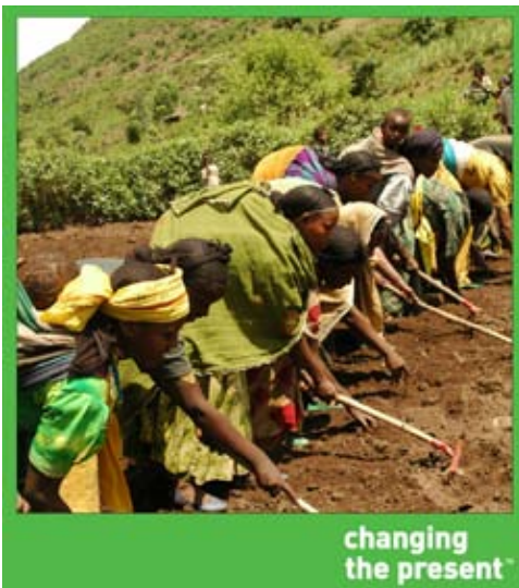
Plant a Garden - International Medical Corps